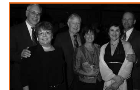
Brown Smith Wallace