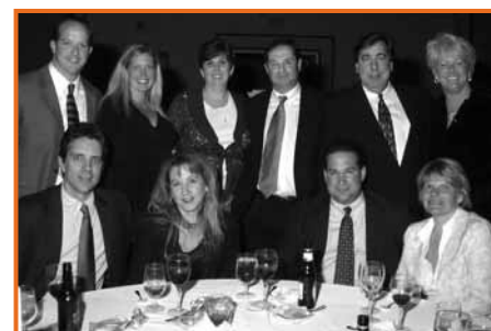
General Credit Forms