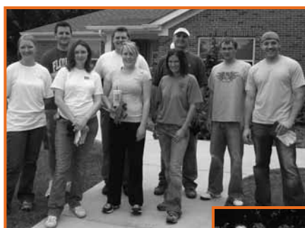
Colliers Turley Martin Tucker