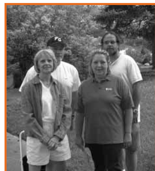
Ellisville Methodist Church