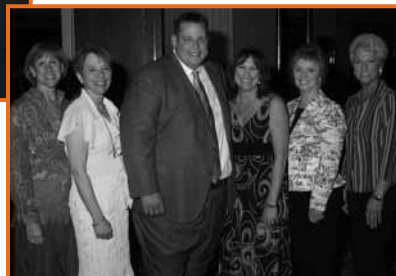
Friends & Staff of Rainbow Village